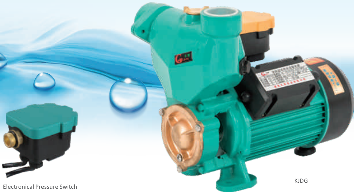
Electronical Pressure Switch

Max Temperature of Fluid up to +80℃ Max Pressure 10bar, Max Ambient Temperature up to 40℃